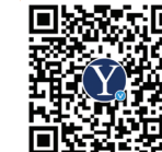
Yale University Weibo 耶鲁大学微博